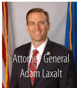
Attorney General Adam Laxalt

The illegal trade of human beings happens everywhere, even here in northern Nevada. Children are especially vulnerable to this crime. State legislation and the Contingency Account for Victims of Human Trafficking provide emergency services for victims. Unfortunately, the existence of such laws is not enough: We need your help to fund these services. SUPPORT OUR SURVIVORS.