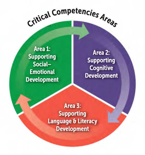
Figure 2. Critical Competencies Areas and Sub-Areas

The Critical Competencies are organized in three learning and development areas and 13 sub-areas as illustrated in Figure 2.